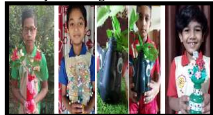
PHOTO FRAME MAKING

The students of Class II felt a sense of achievement during the flower vase making competition thereby boosting their confidence.