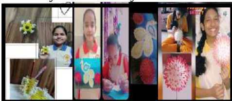
PHOTO COLLAGE MAKING

Activity-based learning can successfully be used to improve both learning as well as teaching. Keeping the same objective in mind Ear Bud Craft Activity was conducted for Class VIII students on Saturday 6th February 2021 .